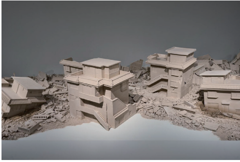
Kim Juree, Evanescent Landscape – Hwiyong : Philadelphia, 2023. The Shape of Time: Korean Art After 1989 .