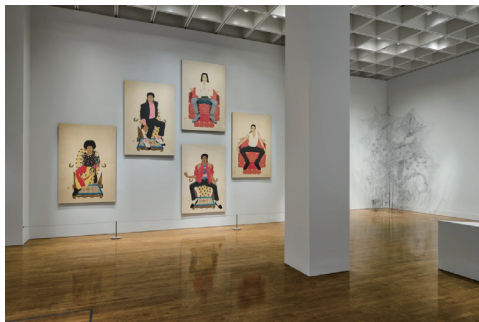
Works by Donghyun Son, Kyeok Kim, Installation view of The Shape of Time: Korean Art After 1989 .