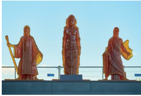
Meekyung Shin, Eastern Deities Descended , 2023. The Shape of Time: Korean Art After 1989 .