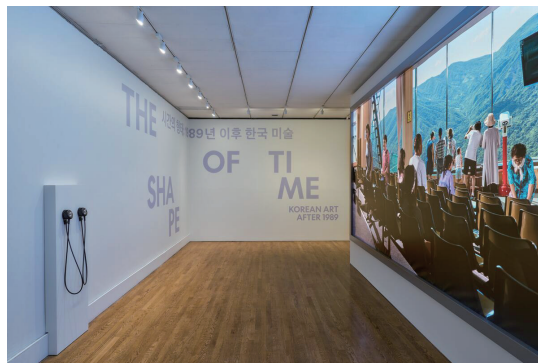
Installation view, Yeondoo Jung, Eulji Theater , 2019. The Shape of Time: Korean Art After 1989 . Courtesy of the Philadelphia Museum of Art. Photo: Timothy Tiebout, 2023.