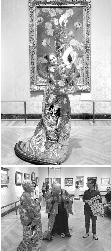
Fig. 2 “Channel your inner Camille #Monet and try on a replica of the kimono she’s wearing in ‘La Japonaise.’”